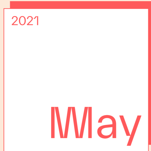
Selection process ↙