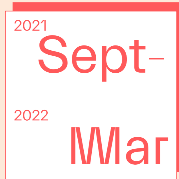
Period during which residencies will run ↙