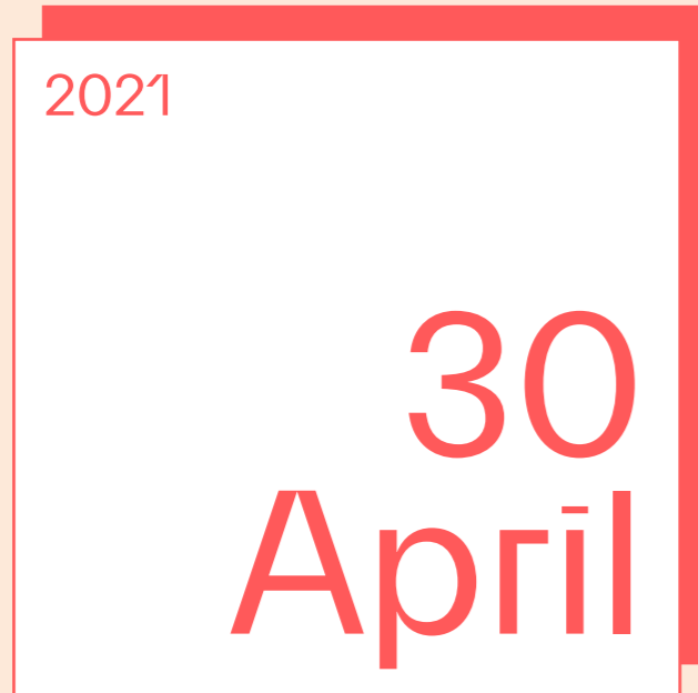
Deadline for applications ↙